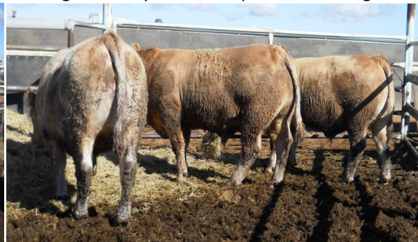
Pen of Violet Hills steers

The aim of our breeding programme has always been to produce a type of Charolais that excels under Australian conditions and meets requirements of our markets. This involves the ability to perform on grass and have the maturity pattern that enables them to finish at a young age, either on grass or in a feedlot, without resorting to cross breeding. From this point of view the results are very pleasing.