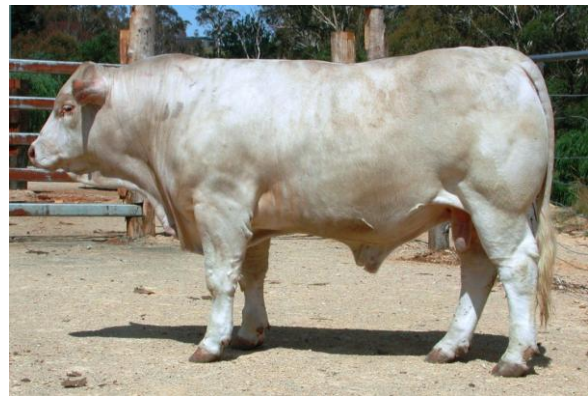
VIOLET HILLS DEMETRIUS (P)