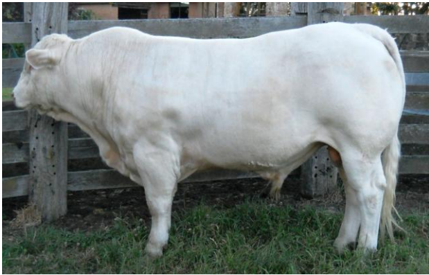
VIOLET HILLS GAELIC WARRIOR (P)