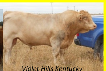
Violet Hills Kentucky